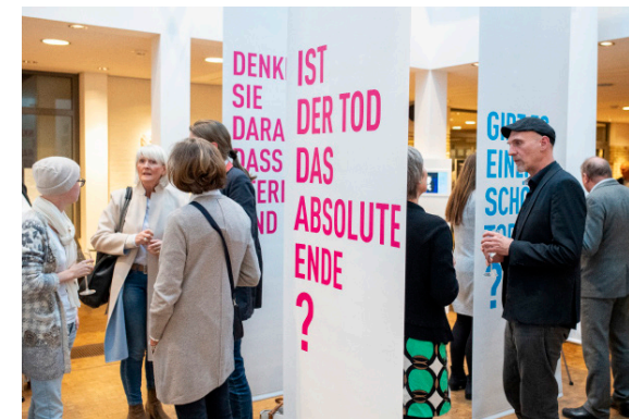
Taking a look at the exhibition "Dialogue with Death"

Whereas other central areas of life are governed by more open forms of language and behavioural norms, speechlessness often prevails in German culture when it comes to the issue of death. Death is Part of Life is aimed at encouraging people to face up to their mortality and at overcoming the silence surrounding these issues. Events, artistic performances, and publications encourage people to speak about death and dying, farewell and grief, and to recognise that these issues form part of our lives.