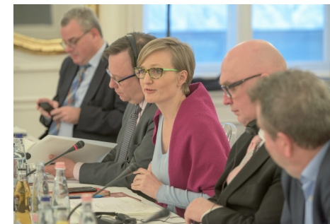
170th Bergedorf Round Table, March 2019 in Budapest