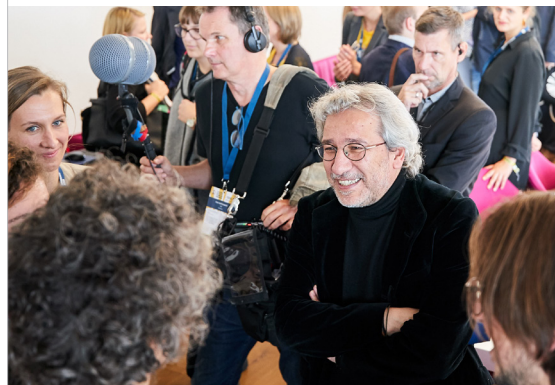
Journalist and author Can Dündar attended the Exile Media Forum 2019

are migration and globalisation changing the German media landscape? And what role is digitalisation playing in these changes? Once a year, the forum invites around 100 experts and people from the media to Hamburg to discuss the issues of the future, identify new trends and share experiences.