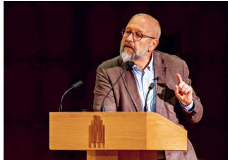
Network event opening the Biennial Meeting of German Historians with a lecture by Herfried Münkler