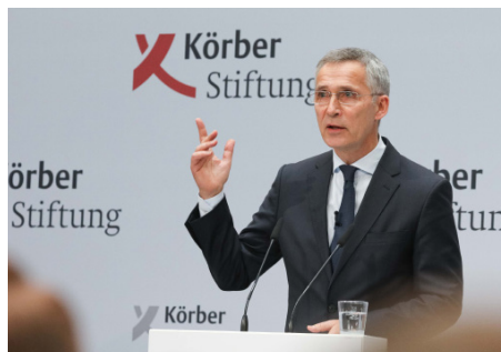
NATO Secretary General Jens Stoltenberg