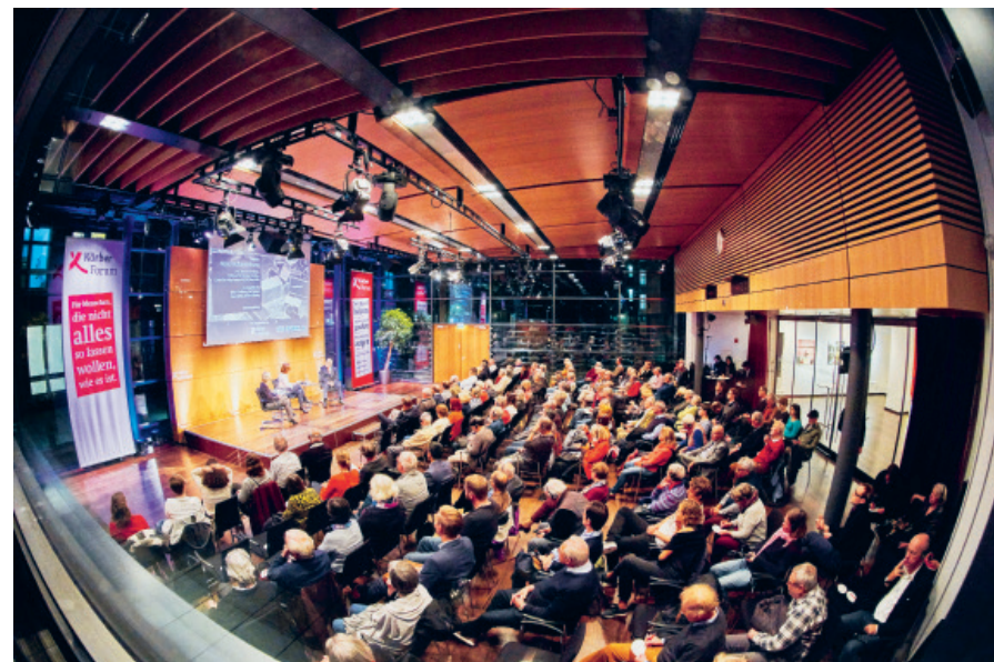
A room full of possibilities: KörperForum at Kehrwieper 12, Hamburg