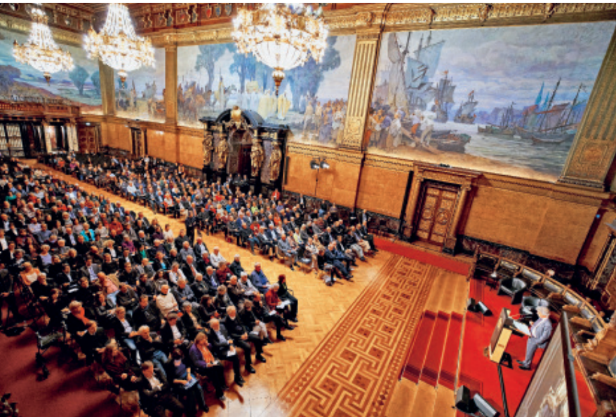
The opening event of Hamburg Horizons