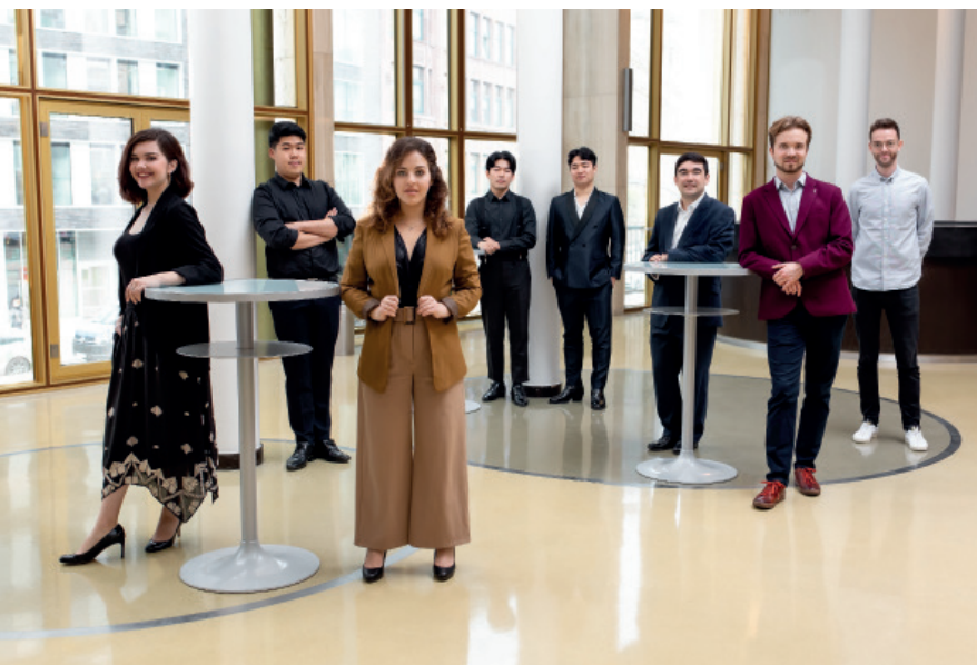
Photo session in the foyer of Hamburg State Opera