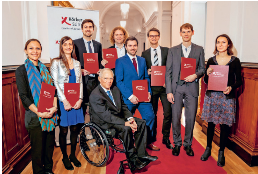
Presentation of the German Thesis Award at the Parliamentary Society in Berlin