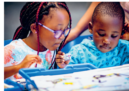
More than just a puzzle: participants in Code Week Hamburg