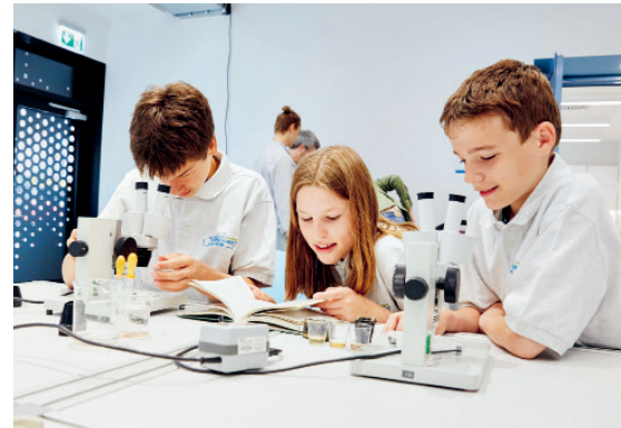
Experimenting at the Students' Research Centre Hamburg

The Students' Research Centre Hamburg provides children and young people who are interested in STEM subjects with a professional framework in which to pursue their own projects and to conduct research both individually and as part of a team. Teachers and university students support the young researchers. In addition to Körber-Stiftung, Hamburg's Ministry for School and Vocational Training, the Joachim Herz Foundation, the Nordmetall Foundation and the University of Hamburg are all involved in the project.