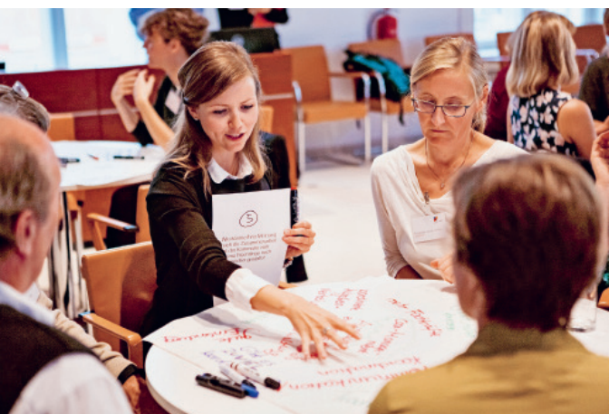
At the World Café: Discussing the city of the future

Civic engagement strengthens democracy, improves people's quality of life and contributes to a sense of community. Engagierte Stadt is a network programme based at Körber-Stiftung that is supported by six other foundations and the Federal Ministry of Family Affairs, Senior Citizens, Women and Youth. The programme provides funding and advice for municipal infrastructural projects aimed at promoting civil society participation. It accompanies people and organisations along the joint path to becoming resilient communities and tests new forms of strategic cooperation at the local level.