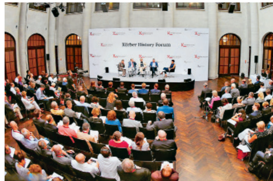
The Körber History Forum takes place at Humboldt Carré in Berlin

In an age of growing political, national and religious divisions, discourses of history have become inseparable from their political meaning. The Körber History Forum addresses issues of history and politics on a European and global level, annually bringing together 200 international experts from the realms of academia, politics and diplomacy, civil society and the media in Berlin. The Körber History Reflection Group complements the forum, inviting international experts and opinion-makers to confidential round-table discussions at venues central to Europe's contested past.