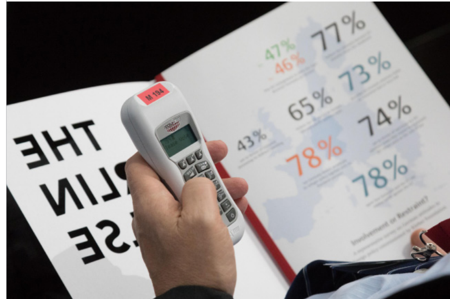
Interactive engagement with The Berlin Pulse

The Political Breakfasts provide an opportunity for heads of state and government, foreign ministers and other influential politicians from Asia, the Middle East, Eastern Europe and the CIS countries to take part in discussions about contemporary political issues with a select group of foreign and security policy-makers. The talks take place in an intimate atmosphere that guarantees an open and frank exchange between the speakers and political representatives from Berlin. This enables the Political Breakfasts to contribute to the culture of political debate in the German capital.