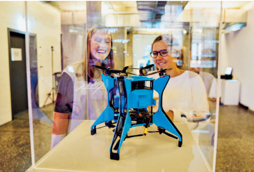
A sense of achievement at 'mint: pink', a NAT project