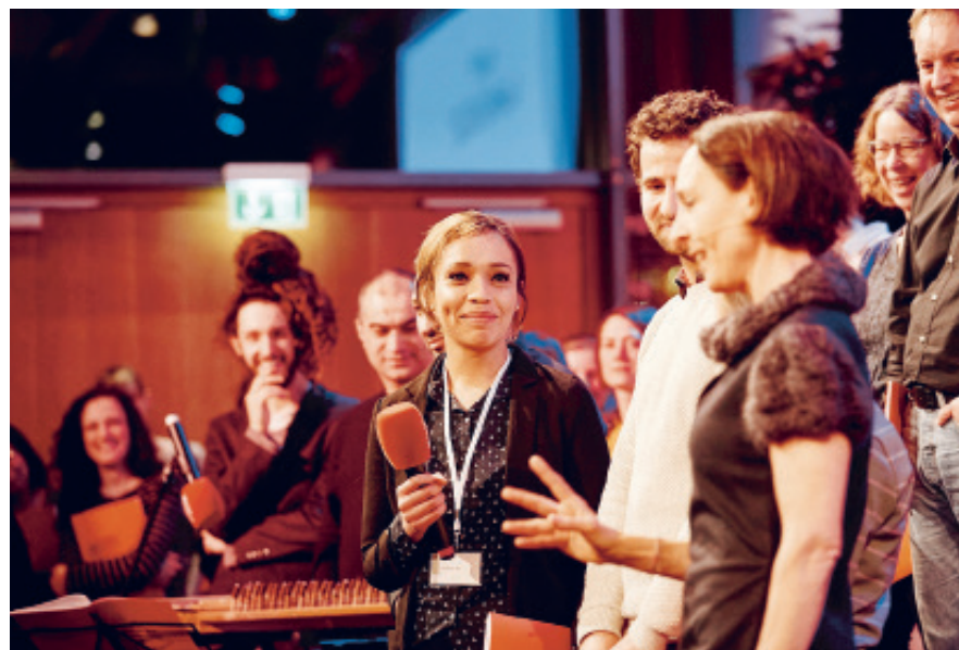
TAOME: music and debate

Concert halls will have to be organised in a more international and multi-diverse manner if they are to consolidate their position in urban societies in the future. So far, the conventional (classical) concert business offers very little space to develop an alternative repertoire to the highest level. This is where the Lab comes in: in cooperation with Ensemble Resonanz, we experiment with innovative programmes and formats and perform them in European concert halls.