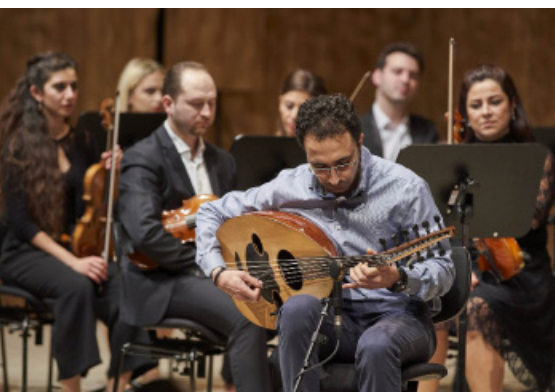
Concert of the Syrian Expat Philharmonic Orchestra during Days of Exile

initiated by the Herbert and Elsbeth Weichmann Foundation in 2016 and has been held annually ever since. Over 50 partners contribute to a wide spectrum of events ranging from exhibitions, concerts, lectures, opportunities to meet people, readings and panel discussions to theatre and film screenings. The prominent 'Speech on Exile' introduces the month-long programme and sets its tone.