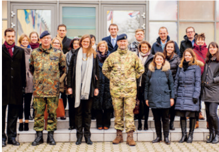
A field trip with Körber Network Foreign Policy