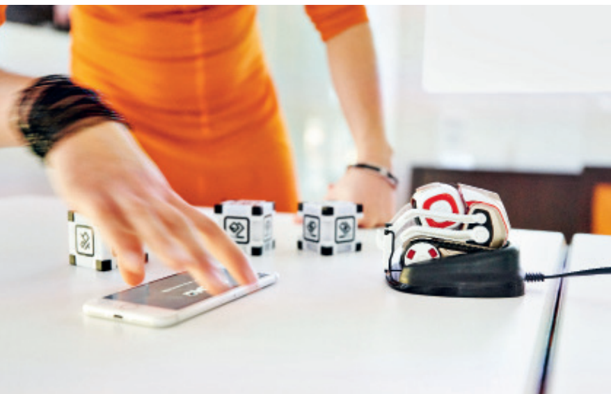
Curiosity, willingness to experiment and enthusiasm provide access to new technologies

Germany is a country of technology. In order to enable Germany's massive potential for innovation to unfold, society needs to remain open-minded and show readiness to engage in debate. As part of our focus topic Technology Needs Society, we identify innovation and innovators from business, research and civic engagement, and also facilitate debate. Furthermore, we demonstrate how people can participate in technological development. It is crucial that the public remains informed about novel technologies; however, it is just as important that engineers, software developers and other experts involved in future technologies reconcile their work with the common good. This process enables stakeholders to come to an agreement on fundamental decisions, the framework affecting technological development, the potential need for catch-up in a particular field, and whether deliberate limitations should be placed on certain types of technology. In doing so, we enrich the process of innovation as a whole.