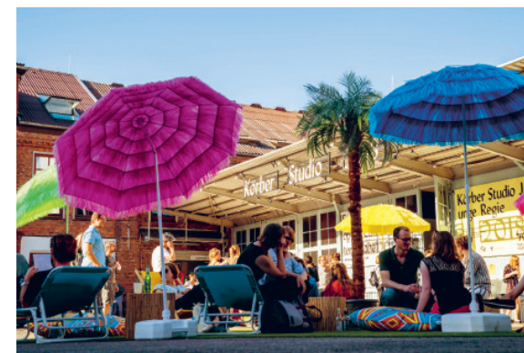
Summer atmosphere at Thalia Gausstrasse in Hamburg

Körper Studio for Young Theatre Directors is held by Thalia Theatre, Körper-Stiftung and Theatre Academy Hamburg under the auspices of the Deutscher Bühnenverein. We provide the winner with €10,000 towards the costs of their next production at a city, state or independent theatre.