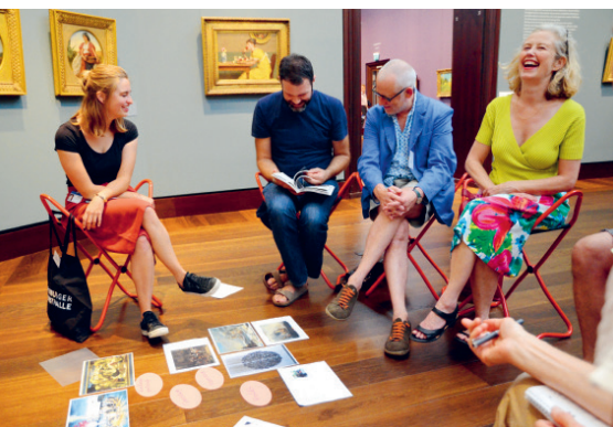
Mind mapping in Hamburger Kunsthalle

My Perspective takes cultural participation seriously. We enable people from Hamburg to participate actively in exhibitions and art education. Together with Hamburger Kunsthalle, we invite very different people to contribute to the museum by providing us with their views of art and then integrate these aspects temporarily into the permanent exhibition.