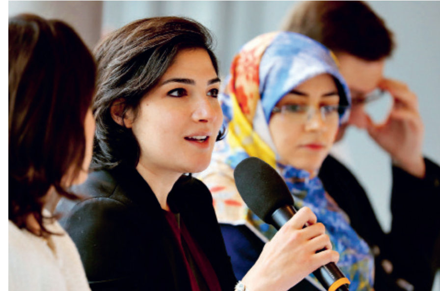
Discussions with the Munich Young Leaders

With the expertise gathered during more than 40 years of the Federal President's History Competition and the formation of a network of historians and people involved in history education and teaching, Körber-Stiftung aims to strengthen activities for historical education in schools and to anchor them as part of the training undertaken by history teachers. The network promotes appropriate forms of historical education for younger generations and provides impetus for dealing with the past, especially in Hamburg.