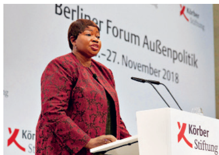
Fatou Bensouda, Prosecutor of the International Criminal Court

Since its establishment in 2011, the Berlin Foreign Policy Forum has developed into the most significant annual foreign policy conference in Berlin. It brings together around 250 high-ranking national and international politicians, government representatives, journalists and other experts to discuss the foreign policy challenges facing Germany and Europe. More than half of the participants come from other European countries, the Middle East, Asia or the US.