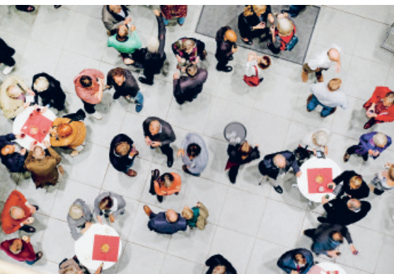
The KörperForum's foyer after an event

Stay up to date on Twitter @KoerberForum (in German)