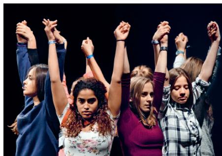
EUSTORY Summits: cross-border encounters of prize-winners