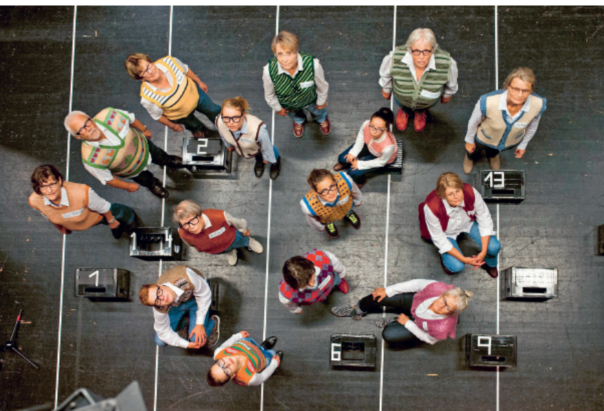
On stage: The Theatre Haus im Park Bergedorf