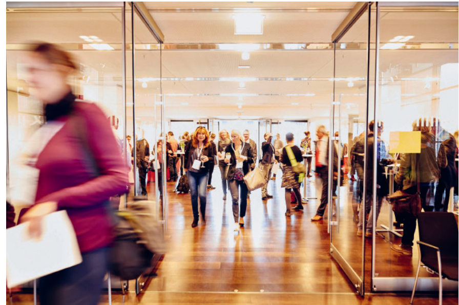
Dynamic exchanges at a STEM BarCamp

The STEM Young Talent Barometer is a nationwide trend report that collates and comments on the most important facts and figures about the next generation of STEM researchers. The report provides information about fields ranging from early education to vocational training and studies. It also includes a compact overview that those responsible can use for empirically-based planning and decision-making in education and politics. The report is jointly published by Körber-Stiftung and the National Academy of Science and Engineering.