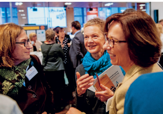
Liveable cities for people of every generation – a symposium with Charles Landry

The Körper Symposium on Demographic Change invites stakeholders and decision makers to gain inspiration and new ideas from national and international pioneers and established projects implementing good practice. We focus on the opportunities opened up by demographic change. Also, we help to ensure that our municipalities will constitute age-friendly environments in the future. The annual symposium is dedicated to various topics such as ageing, civic involvement and social cohesion. Our goal is to ensure that municipalities in Germany come to recognise the potential of demographic change and actively shape their communities.