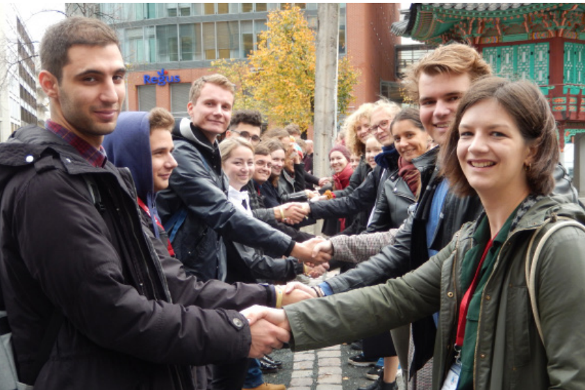
Debating about history: EUSTORY Next Generation Summit 2019 in Berlin