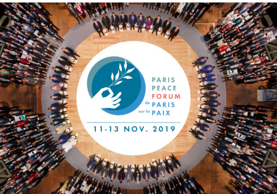
Bird's eye view of the second Paris Peace Forum

The Paris Peace Forum aims to connect actors, advance concrete governance initiatives and, in doing so, strengthen the multilateral order. The annual Forum provides a platform for several thousand participants from global politics, business and society who advocate for cross-border cooperation in tackling international challenges. Körber-Stiftung is a founding member of the Forum, which was initiated by French President Emmanuel Macron.