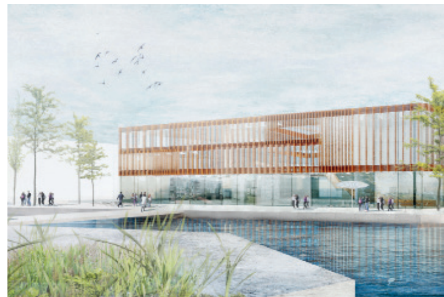
A look into the future: the design drawn up by MGF Architects

Haus im Park accompanies the lives of many of Bergedorf's residents. It has been the cultural and entertainment venue in the east of Hamburg for more than 40 years. Likewise, it also happens to be one of Körber-Stiftung's three locations. We organise special activities for the generation 50plus in Haus im Park that encourage people to meet up and participate in society. With over 500 events a year in the fields of education, culture and health, we offer people the opportunity to learn together, gain new experiences, and be active and creative. We are open to new ideas, different generations and diverse cultures. Networking with other committed individuals in Bergedorf and between projects that connect the young and old, as well as volunteer and refugee aid initiatives brings different people together and ensures that people can demonstrate their commitment to civil society at Haus im Park.