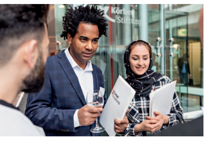
Participants at the Exile Media Forum

programme director at the department for democracy, involvement, cohesion at Körber-Stiftung.