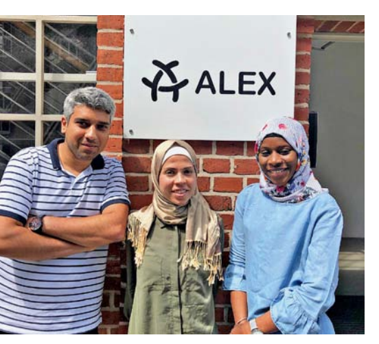
Integration interns at ALEX Berlin

Whereas Bäurle helps people to find employment if they are unable to return to their home country, refugees can also apply directly for scholarships from initiatives such as 'Writers-In-Exile' at the German PEN Centre. The programme has also been around for quite a while – it just celebrated its 20th anniversary. It is funded by the federal