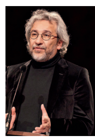
Can Dündar, Speech on Exile

In addition to the main countries of origin, journalists in need of protection tend to come to Germany from Azerbaijan, Uzbekistan, Cuba, China, Uganda, Vietnam, Bangladesh, the Maldives, Eritrea, Sudan as well as many other individual states. In recent years, journalists from European countries such as Hungary, Poland, Macedonia and Ukraine have also once again begun seeking exile in Germany.