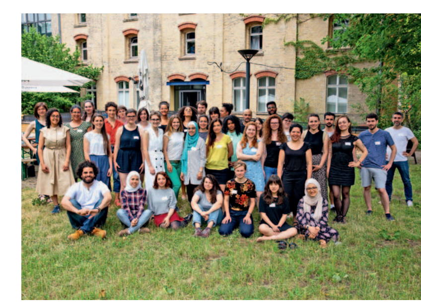
Neue Deutsche Medienmacher

Hamburg Media School offers a further education course for refugees. However, it is a lot shorter and less comprehensive than the internship at ALEX. The school offers refugees involved in the media an opportunity to take a six-month course followed by an internship at a media or film production company. The course is free and there are a total of twelve places available. However, the rules governing the course are quite strict and attendance is compulsory four times a week between 10am and 5pm. Students also need to attend on weekends if filming is taking place. 'We place great importance on attendance and punctuality. We expect the participants to work hard,' says Professor